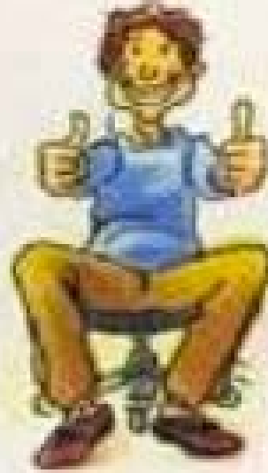
The "Yes" People

They bully & intimidate. Constantly demanding & brutally critical