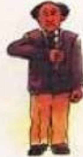
The "No" People

They agree to any commitment, yet rarely deliver. You can't trust them to follow through